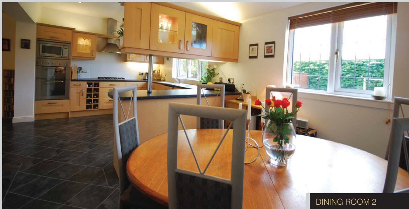
DINING ROOM 2

6 Glen Truim view is a truly unique six bedroom detached villa which has been extended by the current owners to form an extremely spacious family home. Formed over two levels the property benefits from a flexible layout with the perfect balance of reception and bedroom accommodation. On the ground floor there is a hall, cloakroom, formal lounge, living room, family room, dining room, modern fitted kitchen and a utility room. The stairs from the hall rise to the first floor where there are six bedrooms the master of which has an en-suite shower room plus there is a second shower room and a family bathroom which has a bath and separate shower. To the rear of the property there is a wonderful south facing enclosed garden with raised deck which can be accessed via French doors from the family room and Utility room. The remainder of the gardens are mainly laid to lawn with mature trees and shrubs. Off street parking is provided by a mono blocked driveway which leads to an integral single garage which has a door to the utility room. This extremely sought after totally unique property must be viewed to be fully appreciated.